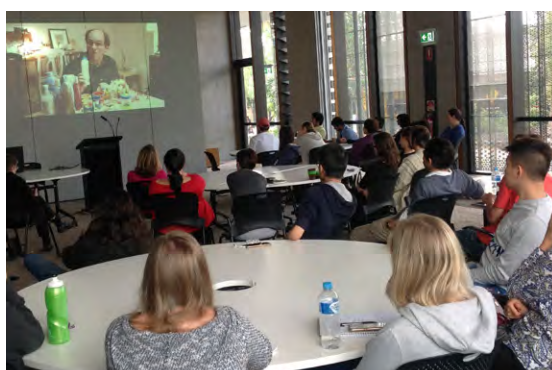
Left: Green Program Representatives attending the Bag It documentary screening