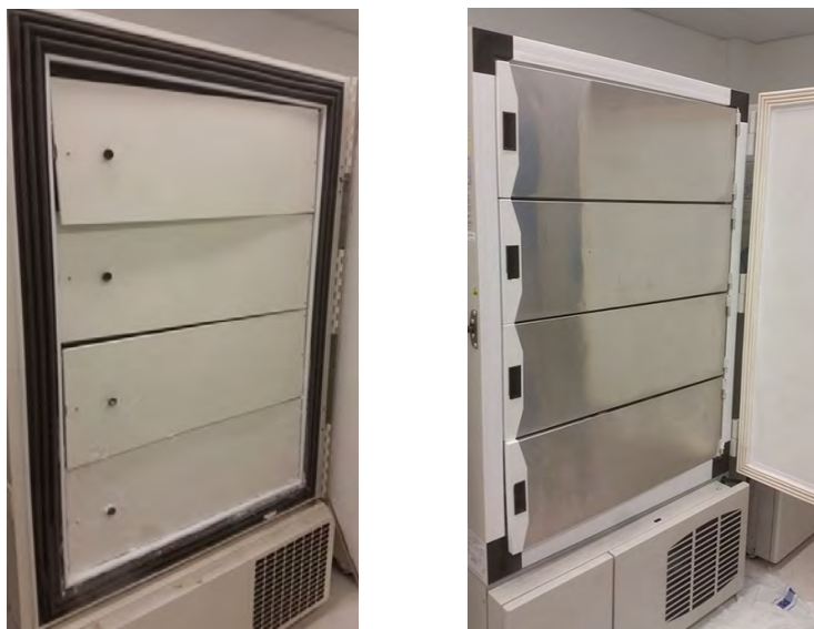
UQ Diamantina Institute freezer after defrost and clean out

The activity aimed to encourage representatives to undertake freezer maintenance with the incentive of winning some great prizes, and of course end up with a well-organised and energy-efficient freezer. The competition raised awareness about the environmental impacts of ULT freezers and the advantages of a proactive maintenance and management plan.