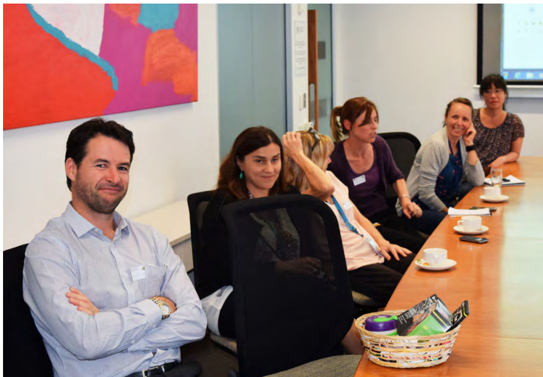
Green Labs representatives at the September update session learning about green chemistry and its role for sustainability