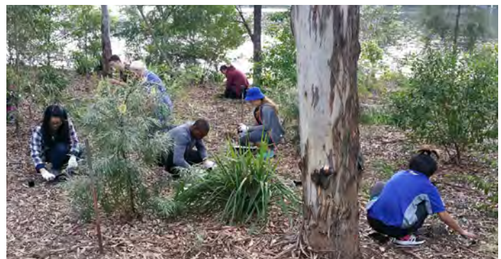
Right: Green Lab representatives were invited to plant trees at the St Lucia Campus during Sustainability Week.