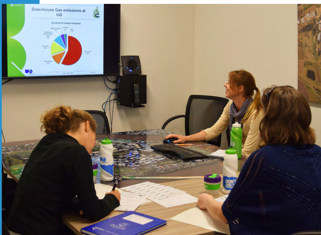
New representatives from AIBN and SBMS at the second Green Labs training session of the year

In 2016, the Green Labs Program held two training sessions, welcoming five representatives from across the University. The program extended its reach, with new representatives joining from the Centre for Mined Land Rehabilitation, the Advanced Water Management Centre, the School of Biomedical Sciences, the Australian Institute for Bioengineering and Nanotechnology (Systems & Synthetic Biology) and the National Research Centre for Environmental Toxicology.