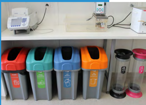
Left: Heron Island Research Station laboratory recycling station includes