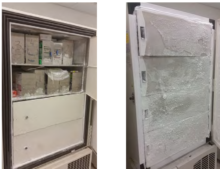
UQ Diamantina Institute freezer before defrost and clean out