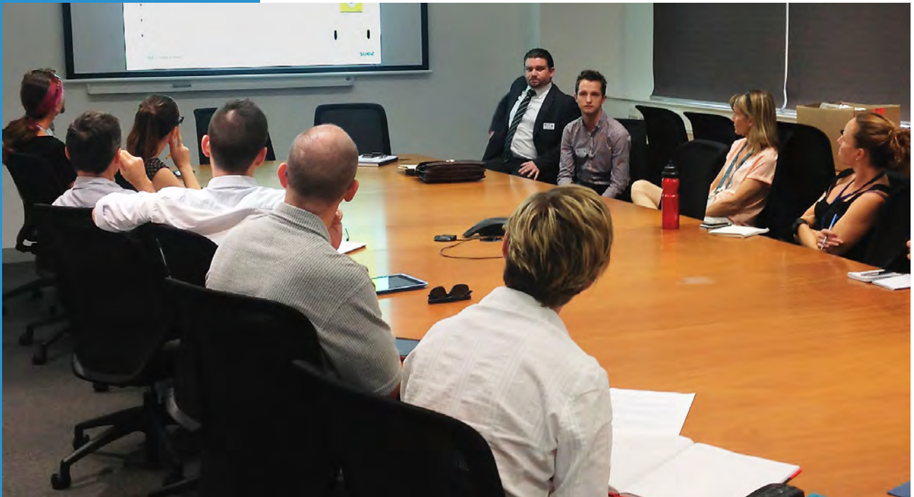
Green Labs representatives learning about laboratory waste management at UQ