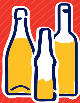
glass bottle & jars