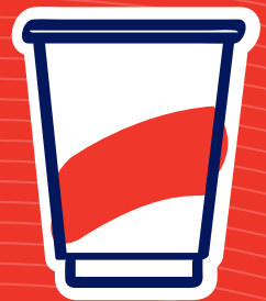
coffee & drink cups