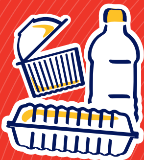
plastic bottles & containers