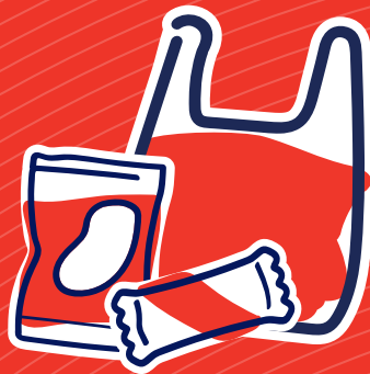
soft plastics (plastic bags, cling wrap, chip packets)